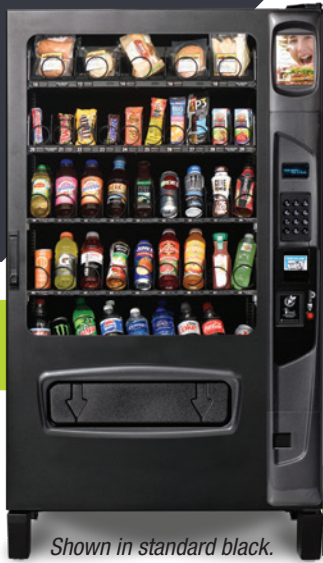
Shown in standard black.